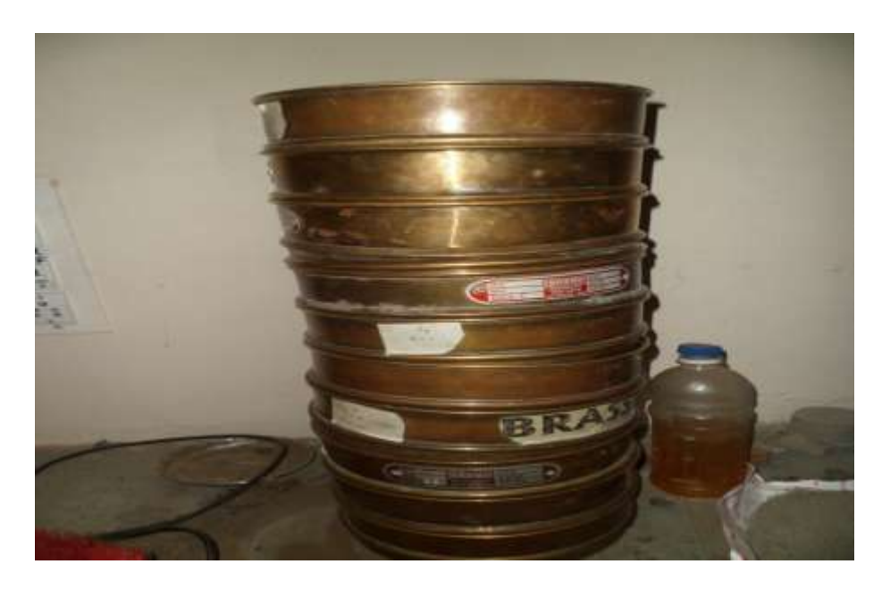
Figure1. Sieve Apparatus for Particle size analysis