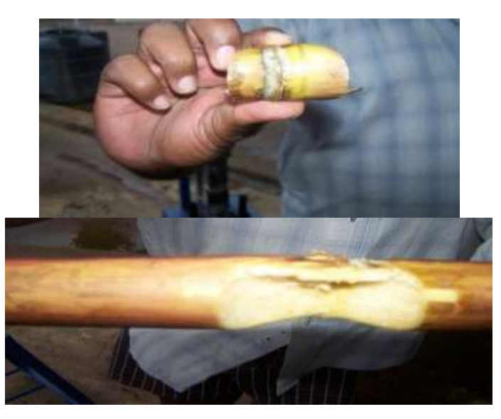
Figure 3. Cutted Sugarcane Buds By Machine

International Journal of Core Engineering & Management (ISSN: 2348-9510) Special Issue, NCETME -2017, St. Johns College of Engineering and Technology, Yemmiganur