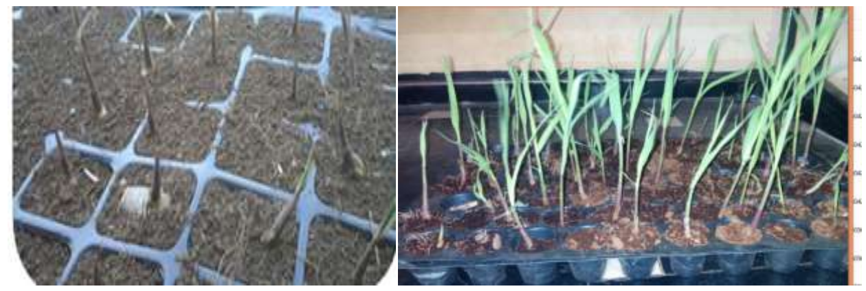
Figure 6.Germinated eye buds (4-5)days after seeding tray for transplantation and Single bud cane