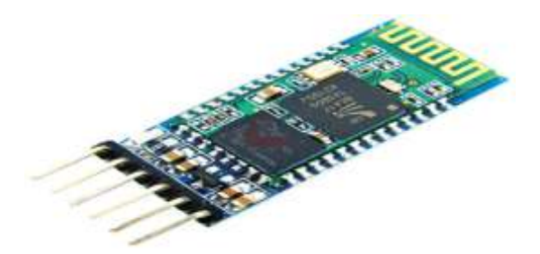
Fig 1: Bluetooth module

Bluetooth module used in this project is HC-05, which supports master and slave mode serial communication (9600-115200 bps) SPP and UART interface. Using these features it can communicate with other Bluetooth-enabled devices like mobile phones, tablets and laptops. The module runs on 3.3V to 5V powersupply