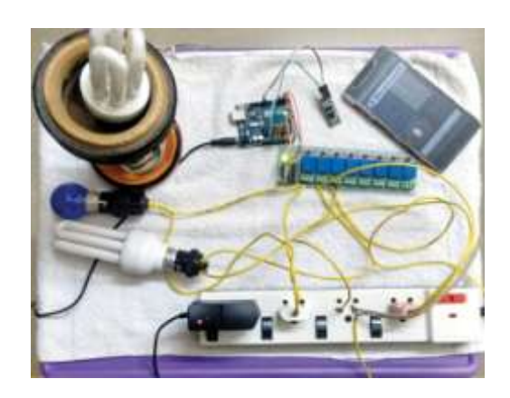
Fig 5: Connection of appliances