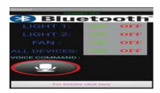
Fig6:Android app design

Thus this is a simple system to monitor all the appliances with out using the internet by just downloading a simple android application. By which you need not provide much cost to adopt this system. This is the system which provides many advantages like billing of each load per day analysis can be known and can control the appliances. This does not require any human efforts. By using this system even faults in the appliances can be known because of the high billing than usual billing.