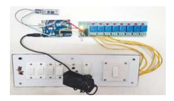
Fig4: Authors proto type

Bluetooth module. Click Bluetooth Image on the app to connect it with the Bluetoothmodule.It automatically connects and displays as Connected in the app.