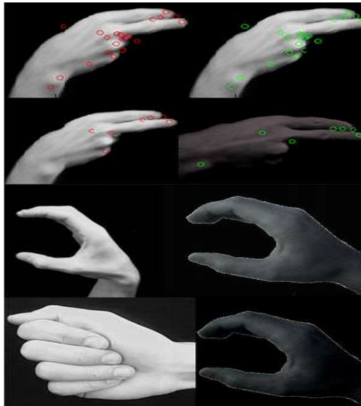
Fig. 3: Results of input and database matched images with varying contrast.

The performance of developed system is shown in figures results show that if image to be inquired is rotated at the angle of 80 degree then there is a probability that half of the results may be incorrect. Moreover, at rotation angle of 60 degree the proposed hand posture system gives very good success rate. Rotation of input image at smaller angles has negligibly small effect on output image.