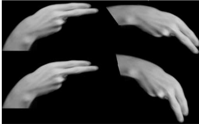
Fig. 4: Result for correct match with rotation of input image.